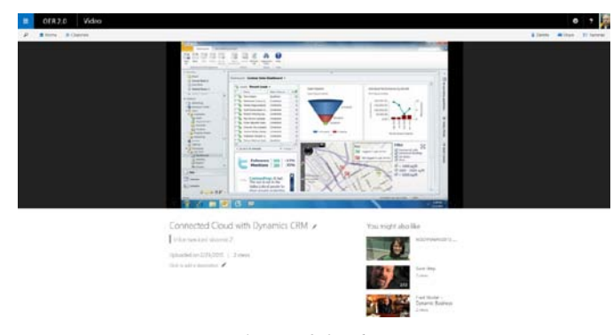
Figure 4. OER 2.0 video service

Finding quickly the right information or document is very important for the successful online educational system. OER 2.0 web portal includes a search functionality which is built upon the search core service. Besides standard search capabilities, it contains advanced features, such as thumbnail previews, click-through relevance, and automatic metadata tagging. Search can be carried out by many criteria such as by site, author, or language.