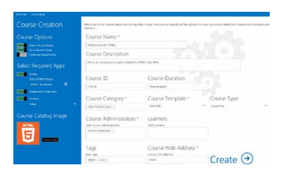
Figure 2. Course creator

It is also possible to upload SCORM packages to instantly create formalized courses, enable enrolment and take advantage of OER 2.0 web portal collaborative features.