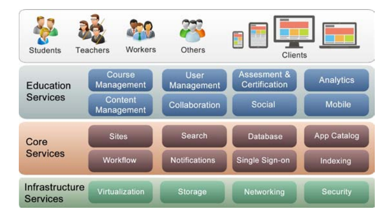
Figure 1. OER 2.0 platform architecture

OER 2.0 is cloud-based, multi-tiered, multi-layered and composite web system which comprises various technologies, tools and applications. Figure 1 shows the architecture of the system, including the platform stack, main services and functionalities, as well as the specific education services.